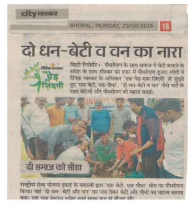
Do Dhan, Beti aur Van, Beti Aur Van, ek per, ek zindagi, the message of Saving girl child was spread with plantation drive

Women empowerment can be brought through education - Students of Hamidia college, including NSS Volunteers organized 'Street Plays in adopted village Hinauti sarak in March 2017, spreading the message of education for girls.