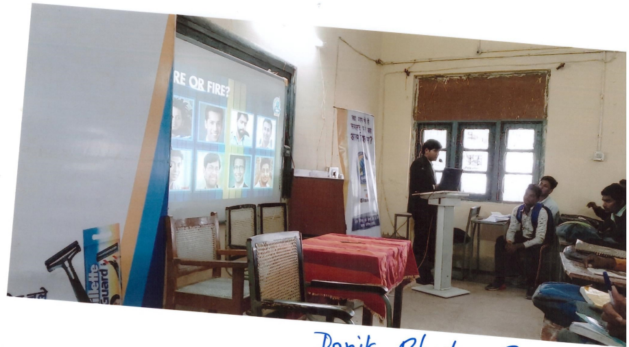
Danik Bhaskar Comp. 2020 20.1.2020