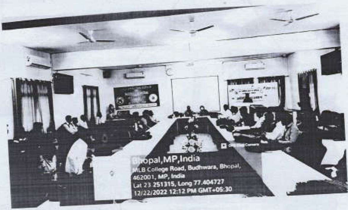
Bhopal, MP, India MLB College Road, Budhwara, Bhopal, 462001, MP, India Lat 23.251315, Long 77.404727 12/22/2022 12:12 PM GMT+05:30

MLB COLLEGE Bhopal College of Arts & Commerce Bhopal